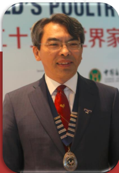
Chairman of Scientific Committee

In the organizing committee, we are very happy to have the top level scientists and key opinion leaders as Chairmen and secretary-general.