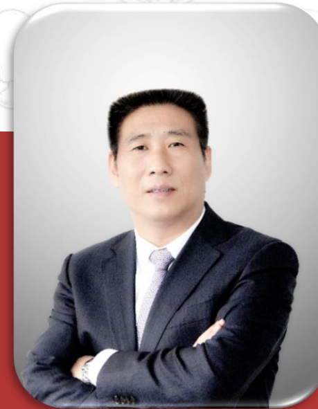
Co-Chair of organizing committee