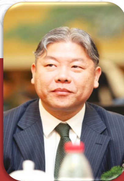
Co-Chair of organizing committee